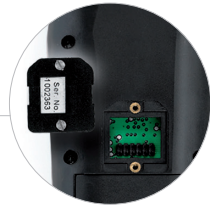
External removable EEPROM SIM module